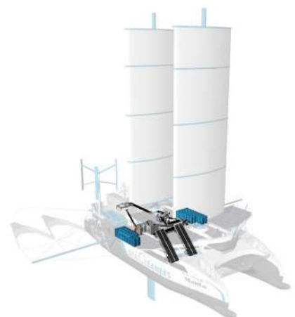
WASTE PREPARATION ZONE